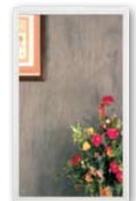
2094-HI 22 x 48