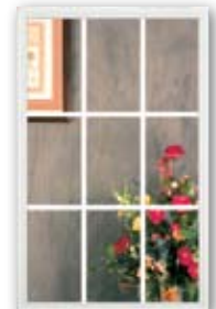
2090GBG-HI 22 x 48